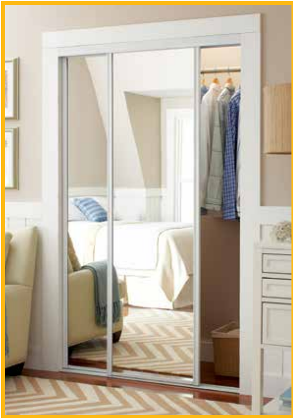
Pictured in a Gloss White finish with Duraflect® copper-free mirror