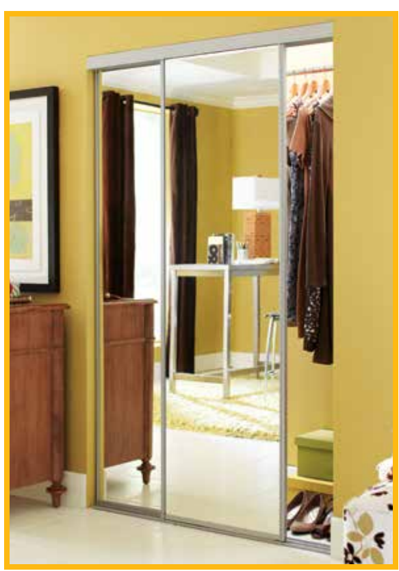
Pictured in a Silver Nickel finish with Duraflect® copper-free mirror