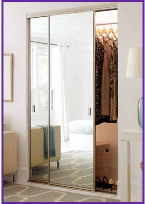
Pictured in a Brushed Nickel finish with a Duraflect® copper-free mirror