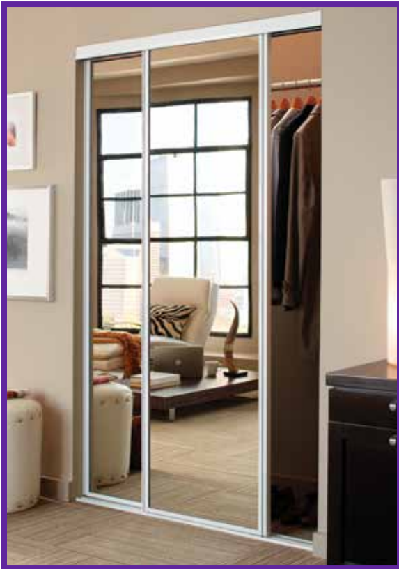
Pictured in a White finish with Duralect® copper-free mirror