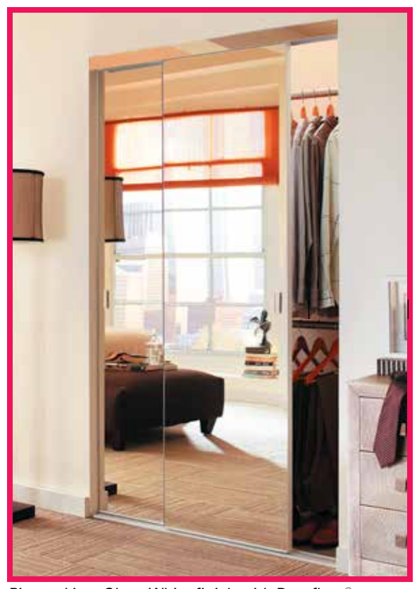
Pictured in a Gloss White finish with Duraflect® copper-free mirror