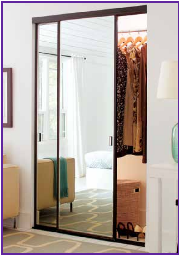
Pictured in a Bronze finish with Duralect® copper-free mirror