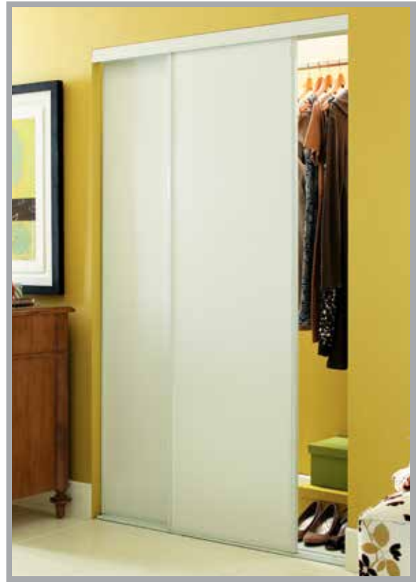
Pictured in a Gloss White finish with White hardboard